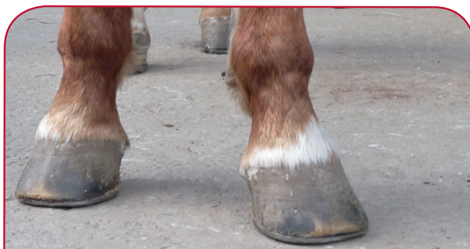
CONFORMATION ABNORMALITIES, SUCH AS TURNED OUT FEET, CAN LEAD TO UNEVEN HOOF GROWTH