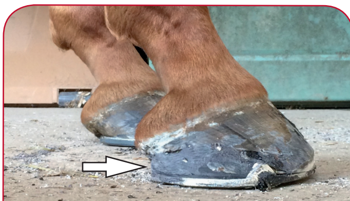
HEEL RECONSTRUCTION TO CORRECT FOOT BALANCE

Slow motion video assessment of the foot and limb flight can also be extremely beneficial both prior to and following corrective farriery.