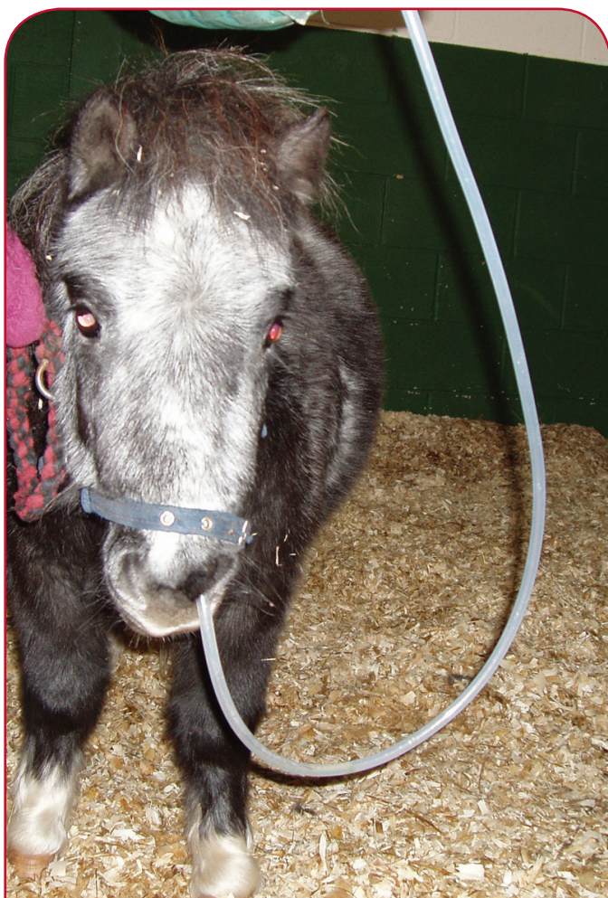
PASSING A STOMACH TUBE ASSISTS IN THE DIAGNOSIS AND TREATMENT OF CHOKE

Due to the sensitive nature of the nasal cavity it is not uncommon to cause a nosebleed; although this may look dramatic it is rarely, if ever, a serious complication