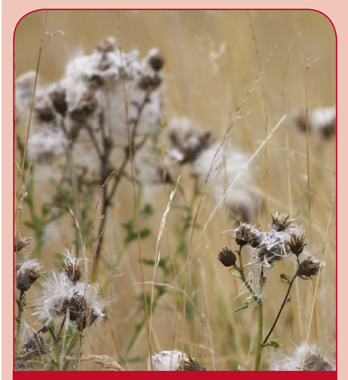
MATURE RAGWORT PLANT WITHOUT FLOWERS