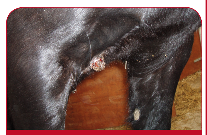
FIBROBLASTIC SARCOID ON THE CHEST