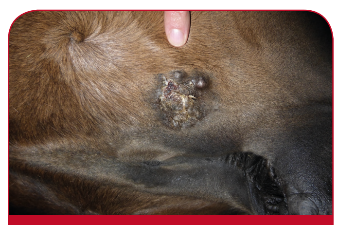
MIXED SARCOID IN FRONT OF THE SHEATH